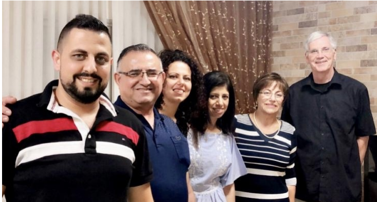
Christmas greetings from Israel and our VOICE OF HOPE radio station staff! Many will come to faith in Jesus in these important days. To God be all Glory!

This phenomenon is called a “ celestial conjunction ” and it will be visible in the night sky on December 21 st of this month. Everyone, no matter where you are on Earth, will be able to see this incredible display in the Heavens!